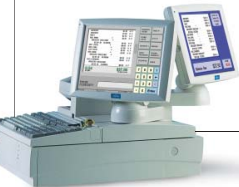
Fujitsu TeamPoS 2000™